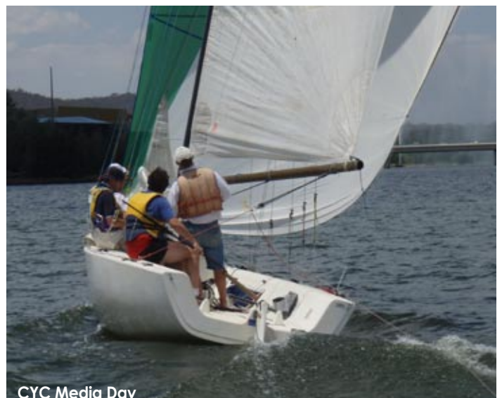
CYC Media Day