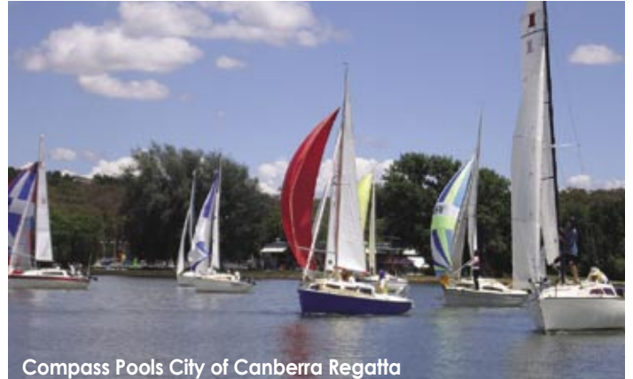
Compass Pools City of Canberra Regatta