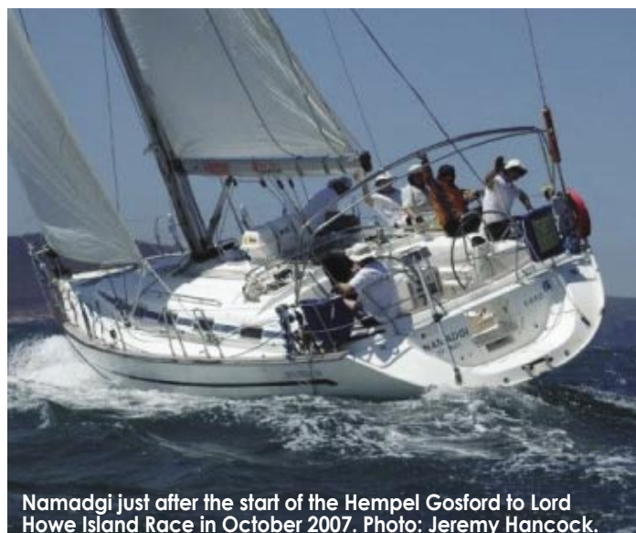
Namadgi just after the start of the Hempel Gosford to Lord Howe Island Race in October 2007.