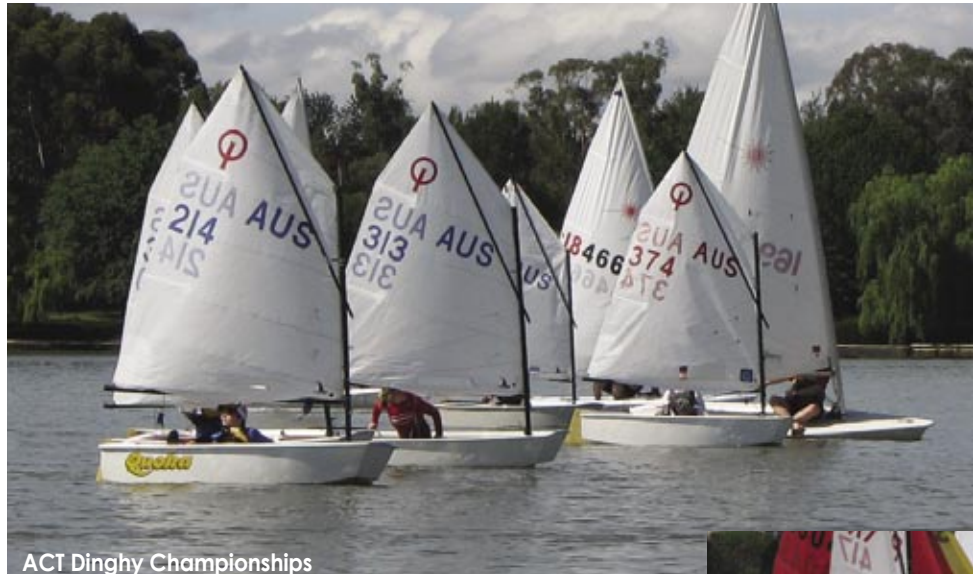
ACT Dinghy Championships

The Canberra Yacht Club acknowledges the generous assistance of the Canberra Southern Cross Club