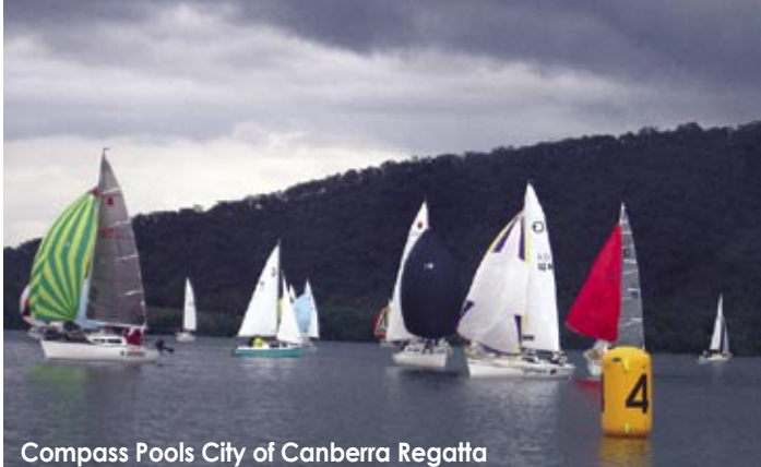
Compass Pools City of Canberra Regatta