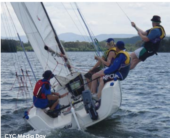
CYC Media Day