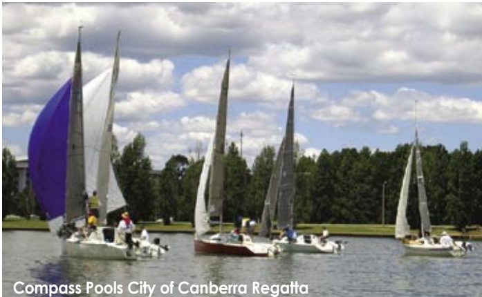
Compass Pools City of Canberra Regatta