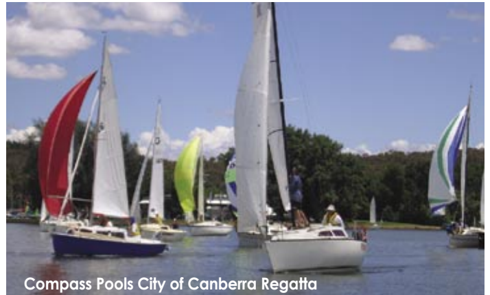
Compass Pools City of Canberra Regatta