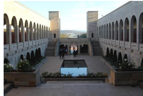
Left: The Australian War Memorial is popular with visitors.

Australian War Memorial is Australia's National war memorial which has some impressive exhibits of wars from around the world. FREE, ticketing required https://www.awm.gov.au