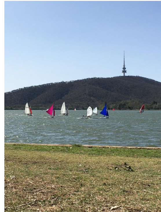
Boats sailing on West Basin, Lake Burley Griffin. West Basin is one of the areas that may be used for the racing. Photo taken by Sue Hextell from the lake foreshore in front of the Canberra Yacht Club control tower.