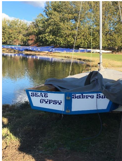
With no sand to negotiate or tide to consider, boats can be stored near the water.

Q. Is it safe to swim and sail on LBG? How deep is the lake?