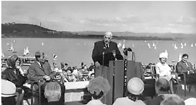
Photo: PM Menzies inaugurates Lake Burley Griffin. Central Basin is shown in the background and may be used for some races depending on weather conditions.

Lake Burley Griffin was created by damming the Molonglo River between Scrivener Dam and the Dairy Road Bridge. The lake was 'born' in 1963, but did not fill to 1964 when the lake inauguration was held.