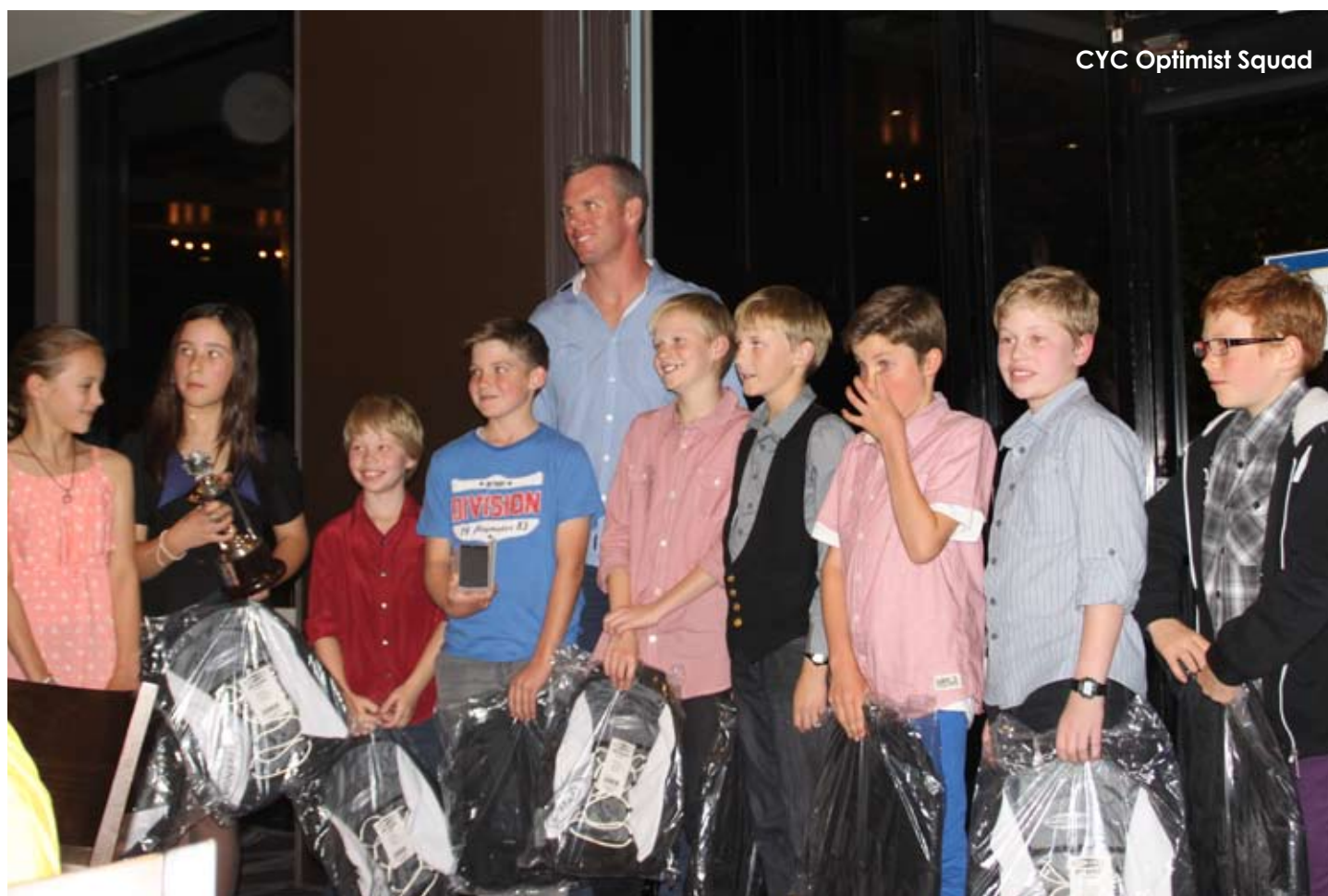
CYC Optimist Squad